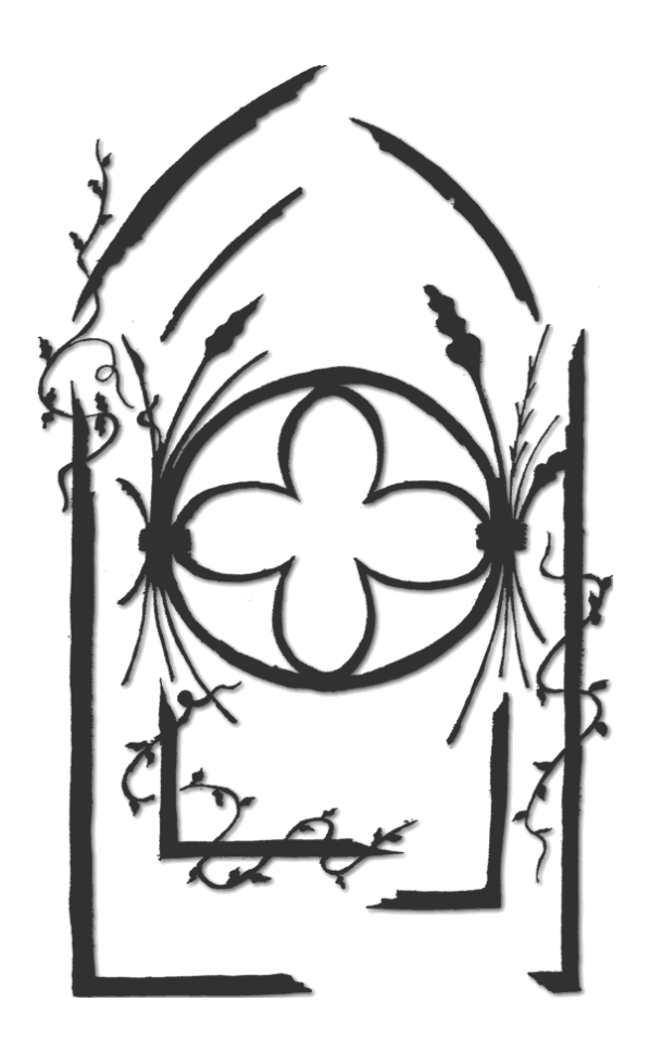
Pleasant Hill Presbyterian Church Online Worship Service Sunday, July 26, 2020 at 11am 17th Sunday in Ordinary Time "Kingdom of Dirt" Week 4