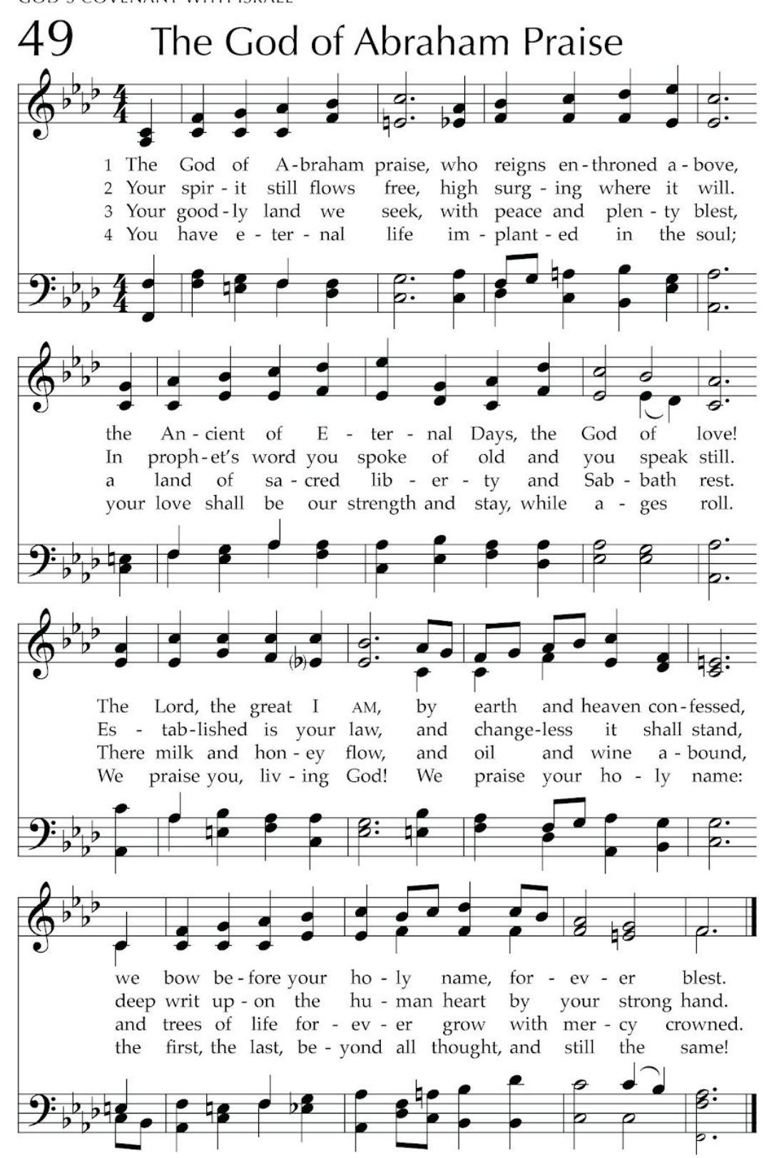
Shaped by its traditional Jewish tune, this selection of English stanzas conveys the essence of the Yigdal , a canticle based on a medieval Hebrew statement of faith about the nature of God and often used in synagogue worship, alternately chanted by cantor and congregation.