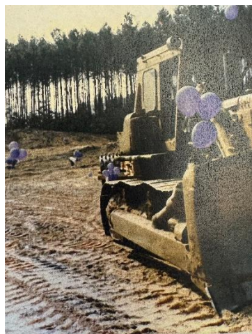
Grader at 3700 worksite

Property at 3700 Pleasant Hill Road was sold for $1 to Atlanta Presbytery by real estate developer, Scott Hudgens in August 1985. The construction company American Building Consultants stated that a grader would be “at the site on Monday morning”. When Dave Fry drove by to check on progress, there was a grader parked on the verge beside the road, but no one was there to operate it. The grader was removed by the next morning, but it had been there on the designated date. Eventually, trees were removed, ground was cleared and locations were marked for the various rooms of the new structure. The ground-breaking ceremony was held on a Sunday in June 1986 following worship at the