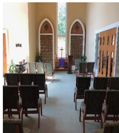
Prayer Chapel and Columbarium

In 2007 a group of members began to think about the need for a final resting place at the church for aging members. On Sep 20, 2007 the PHPC Columbarium Committee met for the first time and began to research options for locations in the church, interview companies that provide columbarium niches, and tour other churches in the area with columbaria. The committee proposed the creation and installation of a columbarium to Session. The project was approved by Session in Oct 2008. Architectural Engineer Jane Bengel created preliminary drawings for design concepts and the working drawings for the construction. The goal of the design was to blend with the existing architecture such that it would look "original". The committee managed every aspect of the columbarium development, purchase, installation and publicity. The pre-sale of niches to PHPC members funded the initial construction of the columbarium including the first phase of installation of niches. The stacks of niches (40 niches per stack) were purchased in phases as additional niches were sold making more funds available. In 2014 the final stack of niches and the liturgical art in the arches above the columbarium were purchased and installed.