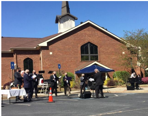
Special Music in the parking lot

In late October 2021, the ministers started offering worship services every other week in the back parking lot of the church, leading the service from the bed of a pick-up truck. Everyone was asked to mask, even outside, and could either sit in their cars and listen