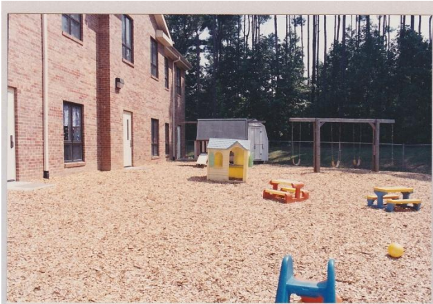
New Playground Equipment 1995

The program made a major step forward when Jane Fitzpatrick was hired in April of 1989 to establish a preschool program. The program began in the fall of the year in the two nursery rooms and two additional rooms on the same hall, with 39 students enrolled. By 1990, enrollment grew to 110 students when it was moved to the newly constructed education building. Gwinnett Early Childhood Education began providing programming for special education students on Tuesdays and Thursdays in January 1992 as a pilot program. The program moved to its own facilities in July of that year. In its fifth year of operation, the preschool had fourteen staff members and 98 students, 25 of whom were from church families. With seven rooms in use, the preschool was accredited by National Association of Education for Young Children (NAEYC) in 1994. To receive this elite accreditation the school met national standards and hosted on-site evaluation. With continued leadership of Jane Fitzpatrick, the preschool flourished and served many families in the area. During this time, Bunny Amason served as chair of the Preschool Board.