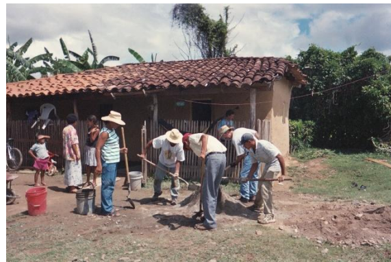
Mixing Cement in Honduras