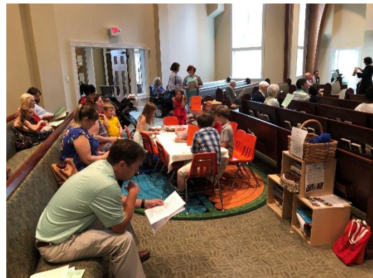
Newly opened Prayground