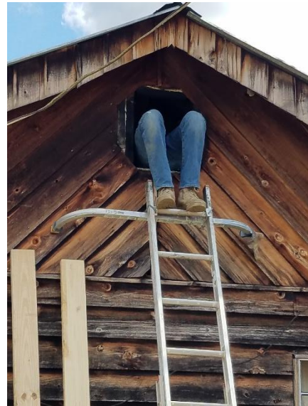
Mission in an attic