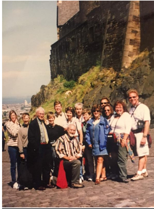
Trip to Scotland