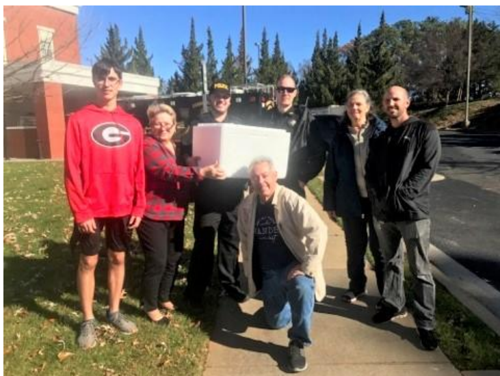
Operation Turkey Sandwich

In 2024, we resumed twice a month morning and evening events at a laundromat nearby in Norcross. Not only are families given the gift of clean clothes, but relationships have grown between the volunteers and the laundry users.